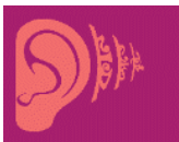
Kaan Pete Roi

DEVELOPED BY KAAAN PETE ROI IN CONJUNCTION WITH DEPT. OF EDUCATIONAL AND COUNSELING PSYCHOLOGY, DHAKA UNIVERSITY